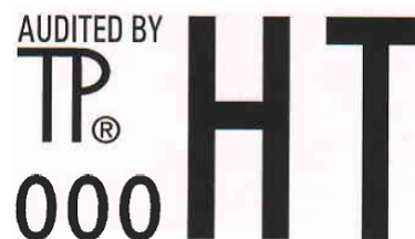
TP HT Mark

The HT mark identifies individual pieces of lumber or lumber components as being heat-treated in conformance with ISPM 15 standards. The mark contains 3 elements; the facility number, the letters "HT" and the agency trademark. The HT mark must be applied legibly a minimum of one time per individual piece and 100% of pieces must be marked (a special provision is made for "small" pieces).